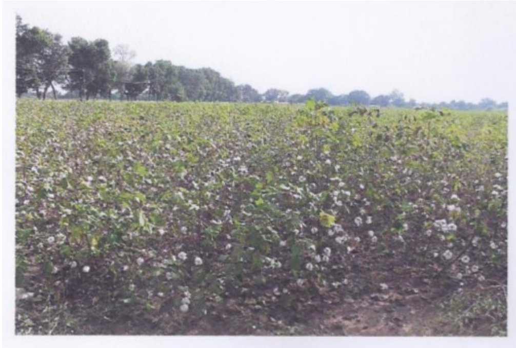
Figure 3. Cotton on the experimental plot at the opening bolls stage