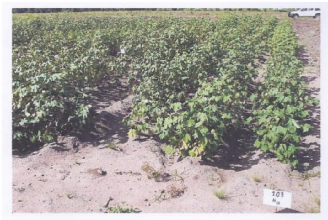
Figure 2. On the right there are 4 lines of cotton treated with Nanoagricole and on the left the one without treatment, which was very affected by drought.

As for the size of cotton, analysis of variance also showed no significant difference between treatments. Dry periods were observed in September and October and, therefore, affected on the size of cotton (Figure 2).